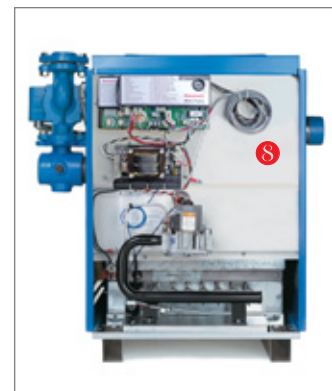
Typical MG 100 E PS interior with Electronic Ignition.

A durable and attractive panel protects controls and wiring.